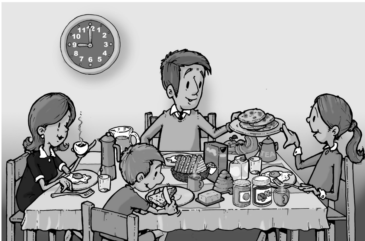
THE SMITH FAMILY

Per ciascuno dei punti indicati, scrivi più frasi.